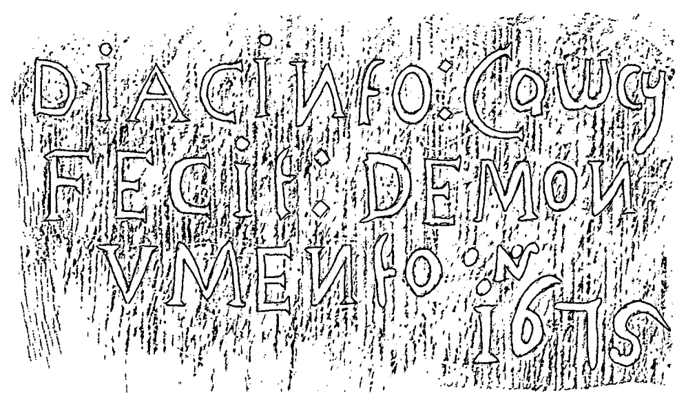
FIG. 114 - Hawstead: rubbing, with ink outlining, of Cawcy incised inscription.

DIACINTO CAWCY IS known by name only because he somewhat impertinently carved it on one of the stones on the north-east side of the chancel arch at Hawstead church. He chose one at eye-level diagonally opposite his gargantuan monument in the centre of the south wall of the chancel to Sir Thomas Cullum, the first baronet (Figs 115–119).' Neither the memorial itself nor the inscription (Fig. 114) is conventionally elegant, and the central arms and crest which crown the monument seem to threaten the viewer below like some frightful monster rearing up in the semi-darkness.