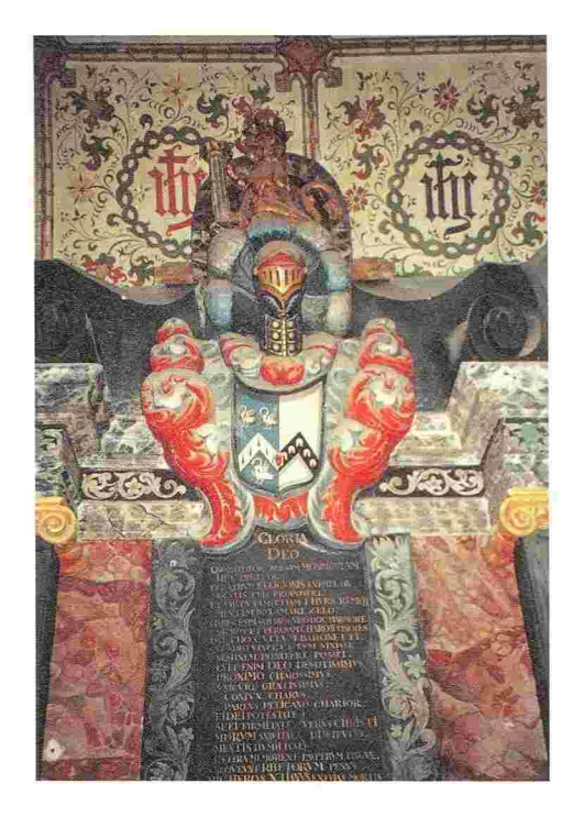
FIGS. 115 and 116 - Hawstead; Cullum monument, details.