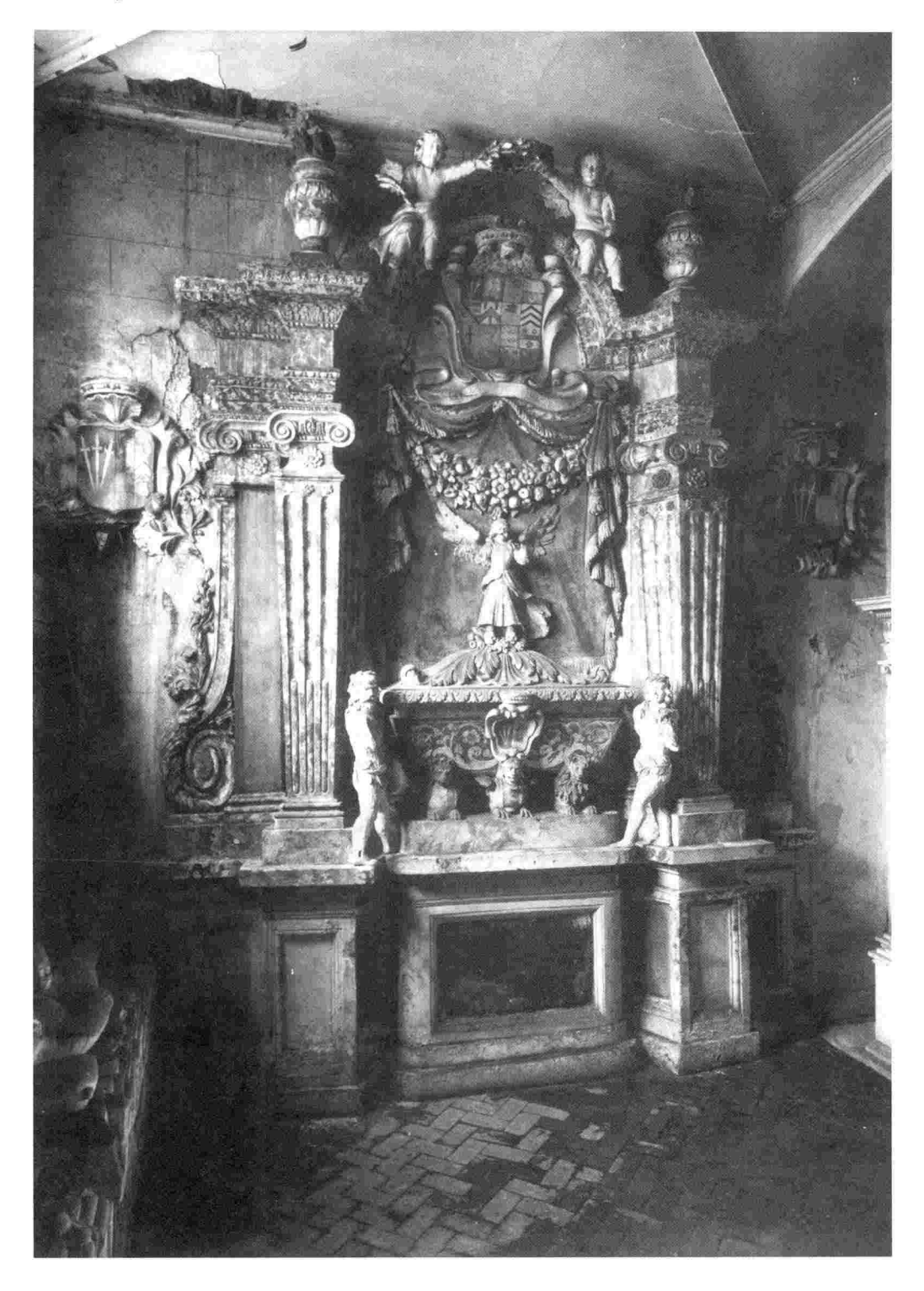
FIG. 125 – Hinton St George, Somerset: general view of monument of John, 1st Baron Poulett (English Heritage, National Monuments Record).