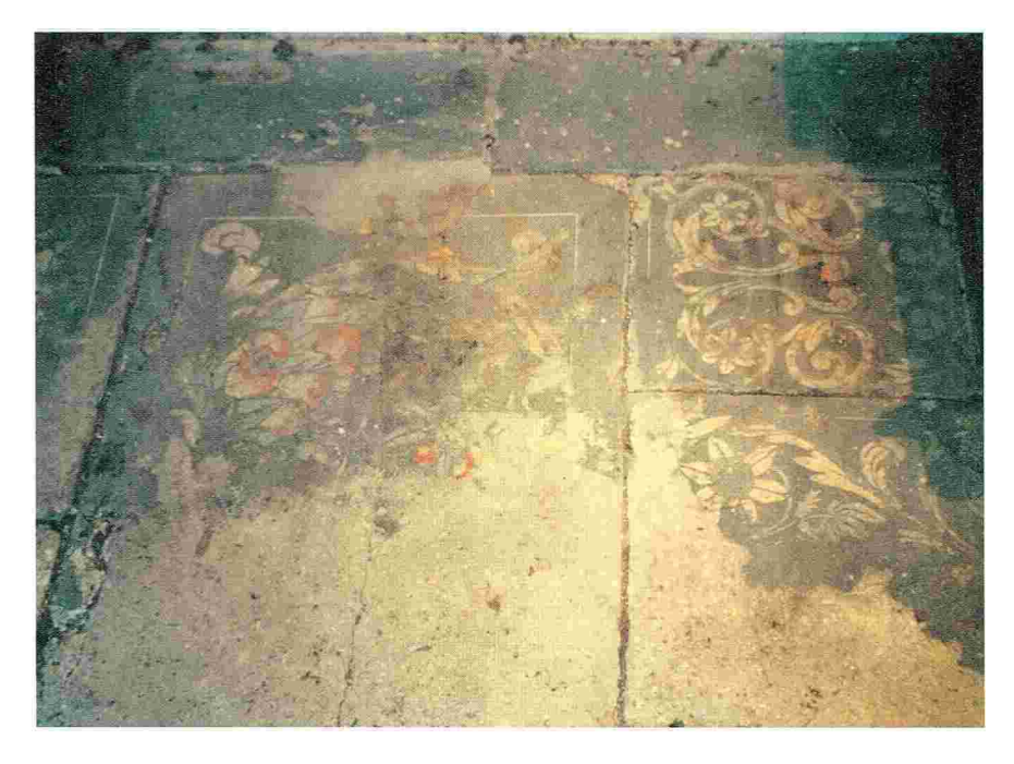
FIG. 121 – Westhorpe: worn painted slabs on floor of Barrow chapel.

FIG. 120 – Mildenhall: mural tablet to Sir Henry North, Bart ( ob. 1671).