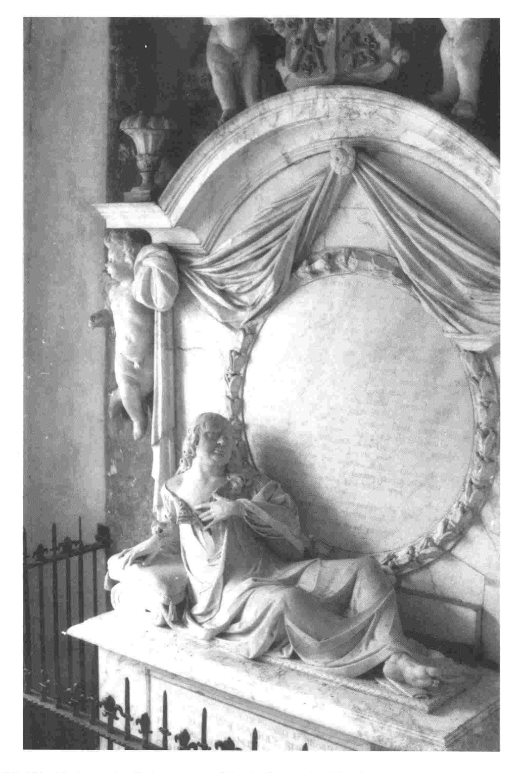
FIG. 124 – Westhorpe: detail of monument of Maurice Barrow (ob. 1666) (by permission of the Conway Library, Courtauld Institute of Art).